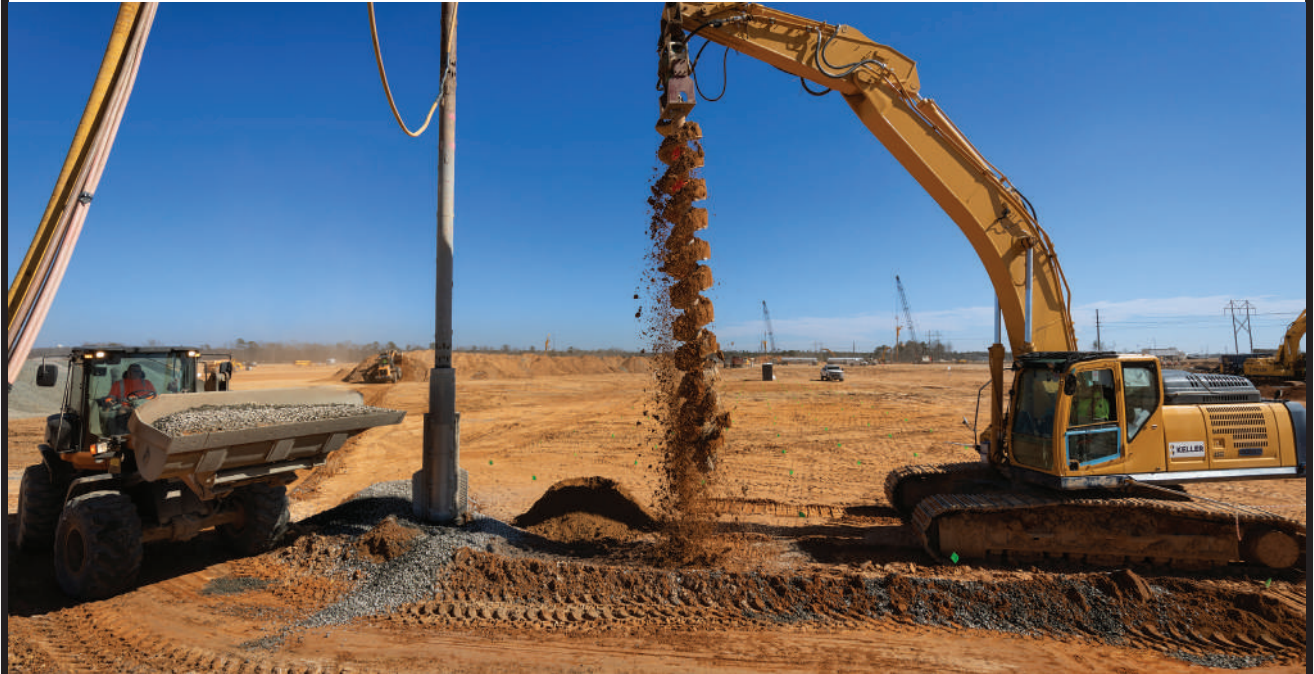
Keller North America ( No. 17 ) is providing ground improvement services over approximately 15 million sq ft of building pads on the $2-billion Scout Motors electric vehicle plant in Blythewood, S.C. The primary scope of work is the installation of aggregate piers with varying depths of 5-30 ft. The facility is scheduled to start production in 2026.