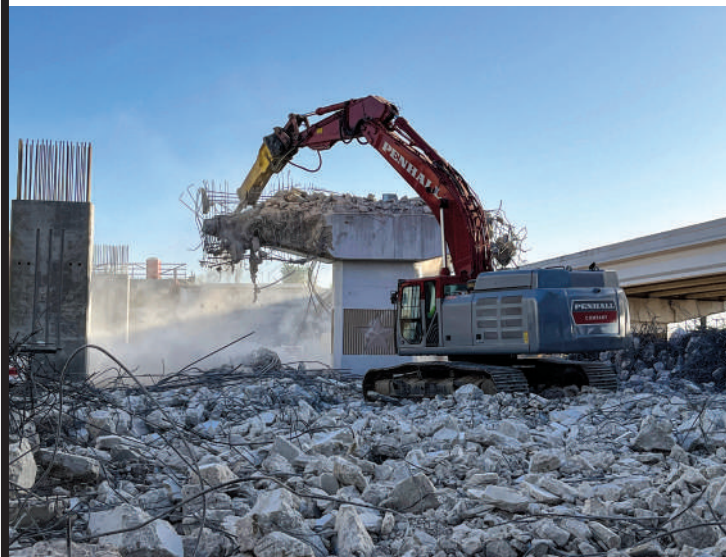
Penhall Co. ( No. 174 ) provided demolition services for the I-2/I-69C Interchange Replacement Project in Pharr, Texas, for the Texas Dept. of Transportation, which involved the removal of 450,000 sq ft of bridge structures.

illustrate the breadth of opportunities available with specialty trades.”